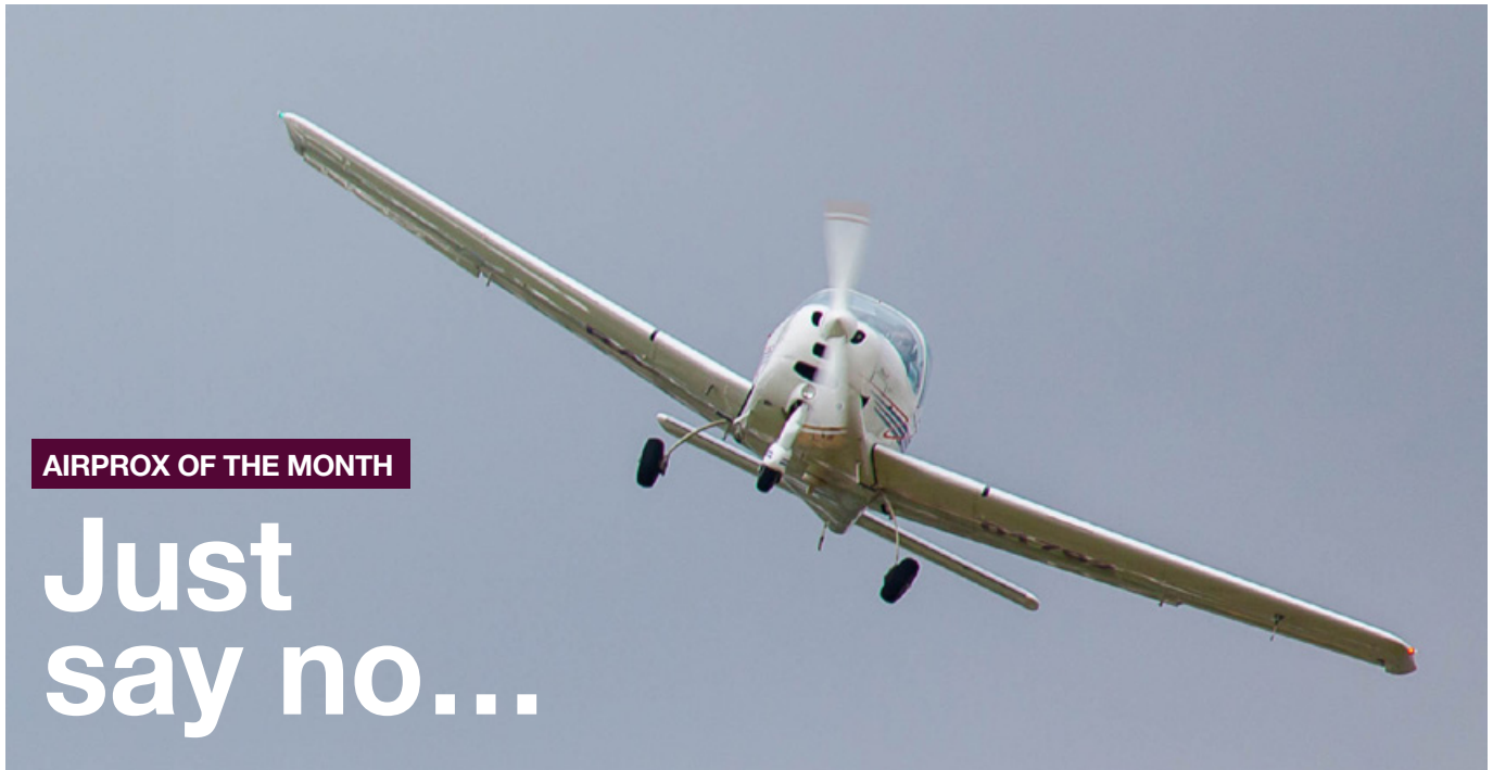
For illustrative purposes only.