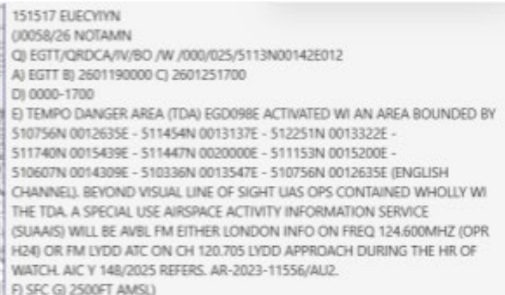
Figure 2 - NOTAM

TDA098 complex had been in operation since 31 st August 2020 with the current AIC Y 148/2025 and AIC Y 019/2026 stating it would be in operation until the 30 th September 2026. Usual practice for LFISOs was to provide aircraft tracking towards the LTMA with the London QNH to assist in onward infringement prevention. Aircraft tracking away from the LTMA were also issued the London QNH to ensure aircraft are vertically separated using the same reference datum. The TDA complex was positioned within the Chatham RPS area, although filets of EGD098F/G overlapped below the lateral boundaries of the LTMA.