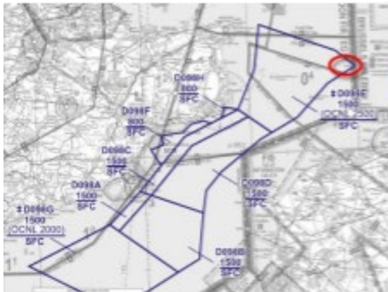
Figure 1 - AIC Y 148/2025 Chart

STRAITS and within Temporary Danger Area (TDA) EGD098E (AIC Y 148/2025) which was NOTAM'd active up to altitude 2500ft (see Figure 1, 2).