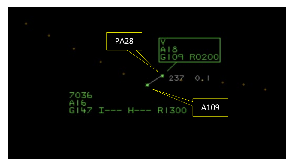
Figure 2 – CPA at 0952:01

Explaining their actions in their [reporting form], the controller detailed, "In line with duty of care requirements in MATS 1 for traffic on a BS, I advised [the pilot of the A109] that there was 'traffic at the same level, 11 o'clock at 1NM'. The pilot reported 'not sighted' so I updated the Traffic Information to 'same level, 11 o'clock half a mile'. I observed [the A109] descend to 1600ft as the radar returns merged".