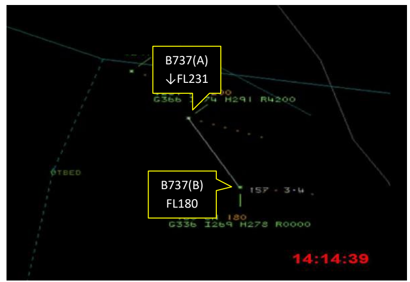
Figure 1. Relative positions of event aircraft when [B737(B)] was transferred to Doncaster ATC.

The base of controlled airspace to the east of OTBED was FL175, however the limits of service provision by Doncaster Radar would not have permitted them to provide a radar service outside controlled airspace until [B737(B)] had passed OTBED.