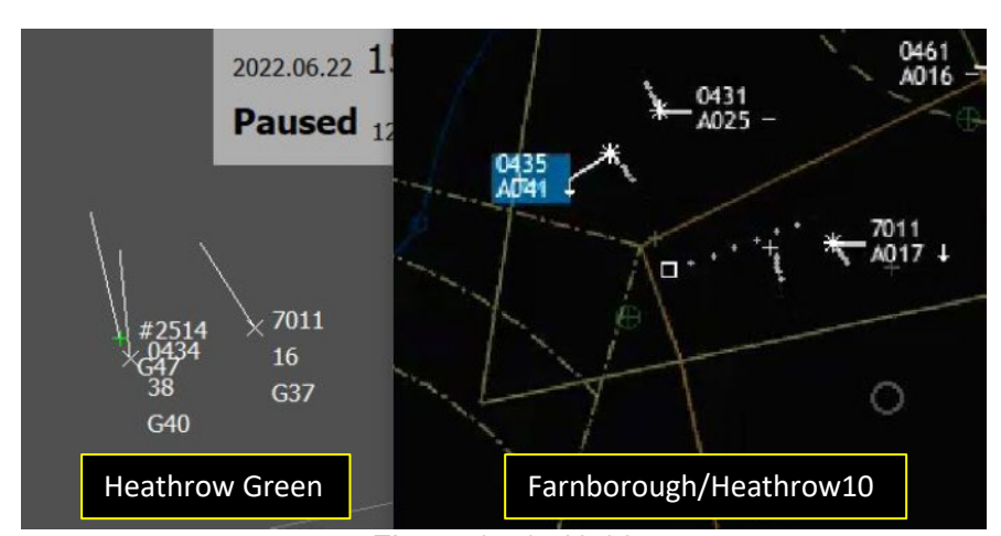
Figure 1 - 1549:00

Figure 1 below shows [the EV97's] Mode A not displaying on the Farnborough/Heathrow10 assigned radar, however the Heathrow Green<sup>1</sup> picked up [the EV97] and a glider, labelled as #0434 and #2514.