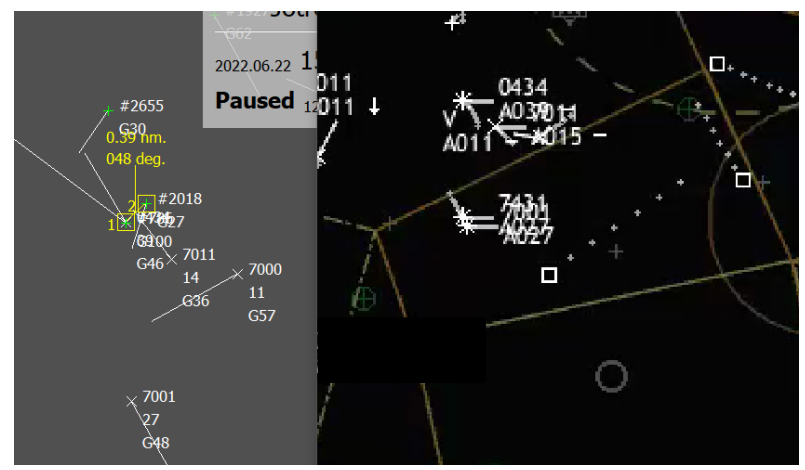
Figure 2 - 1551:28

At 1552:24, [the EV97] could be seen on radar 3NM west-southwest of Lasham, tracking northwestbound, and was observed to overfly a primary return, which was seen on the Heathrow Green, they got within 0.02NM, height unknown.