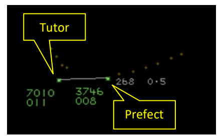
Figure 3 - Tutor pilot requests an updated position of the Prefect.

Fifty seconds later the Tutor pilot requested an update on the Prefect position and were advised that they were abeam the ramp going around. Separation was measured at 0.5NM and 300ft.