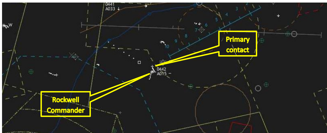
Figure 1 – 1541:33

15:41:21 - "Yeah, Rockwell Commander C/S keeping a lookout".