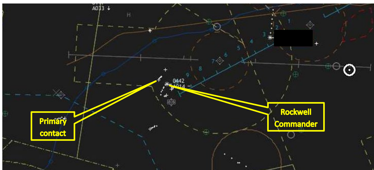
Figure 2 – 1542:41

15:42:39 - "Rockwell Commander C/S, unknown contact west/north west of your position, 1nm southbound, no height".