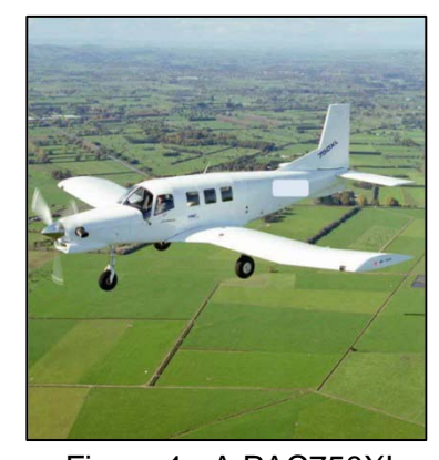
Figure 1: A PAC750XL

He assessed the risk of collision as 'None' as the PA31 was 'across our nose and clear by the time I sighted it.'