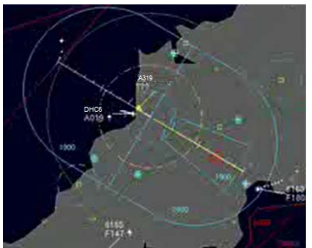
Figure 2 - Newquay Radar at 0800:42

At 0800:42 the two aircraft passed abeam at a range of 0.5nm, with the DHC6 passing 1900ft. There was no radar Mode C readout for the A319 (Figure 2).