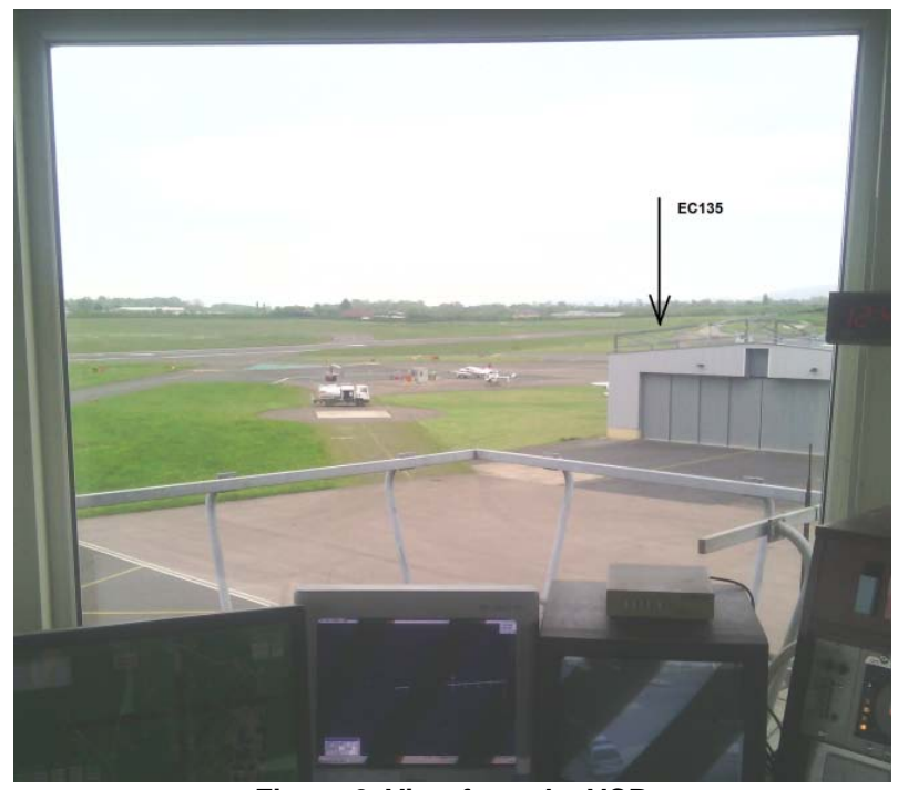
Figure 2. View from the VCR

The C182 was in the RH cct for RW27 and the EC135 was situated on the Apron adjacent to the refuelling point and was just out of the line of sight from the Tower (Figure 2).