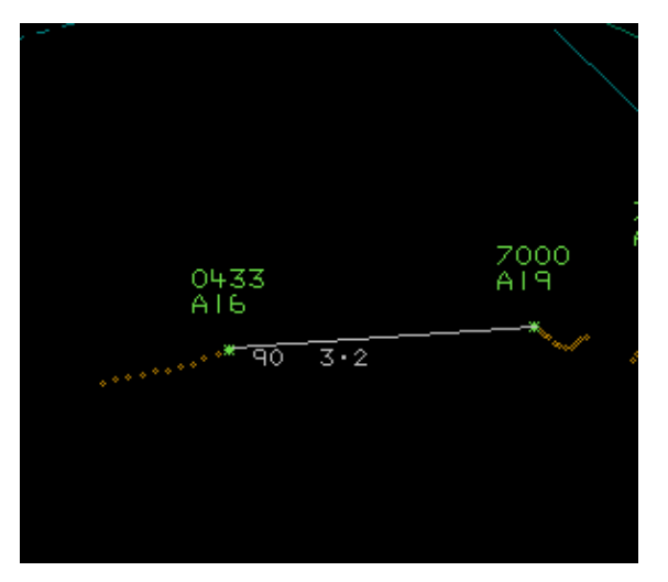
Figure 1 - 1356:01

The C42 was on a local training flight from Elstree and had been operating to the north east. The PA28 pilot had called Farnborough LARS west at approximately 1337:00 and a Basic Service was agreed. At 1352:18 the Farnborough LARS West controller called the PA28 to transfer it to Farnborough LARS North. There was no reply and over the next 4 minutes the controller made another 3 attempts to raise the PA28 but without success. Figure 1 depicts the traffic situation at 1356:01 (PA28 code 0433, C42 code 7000).