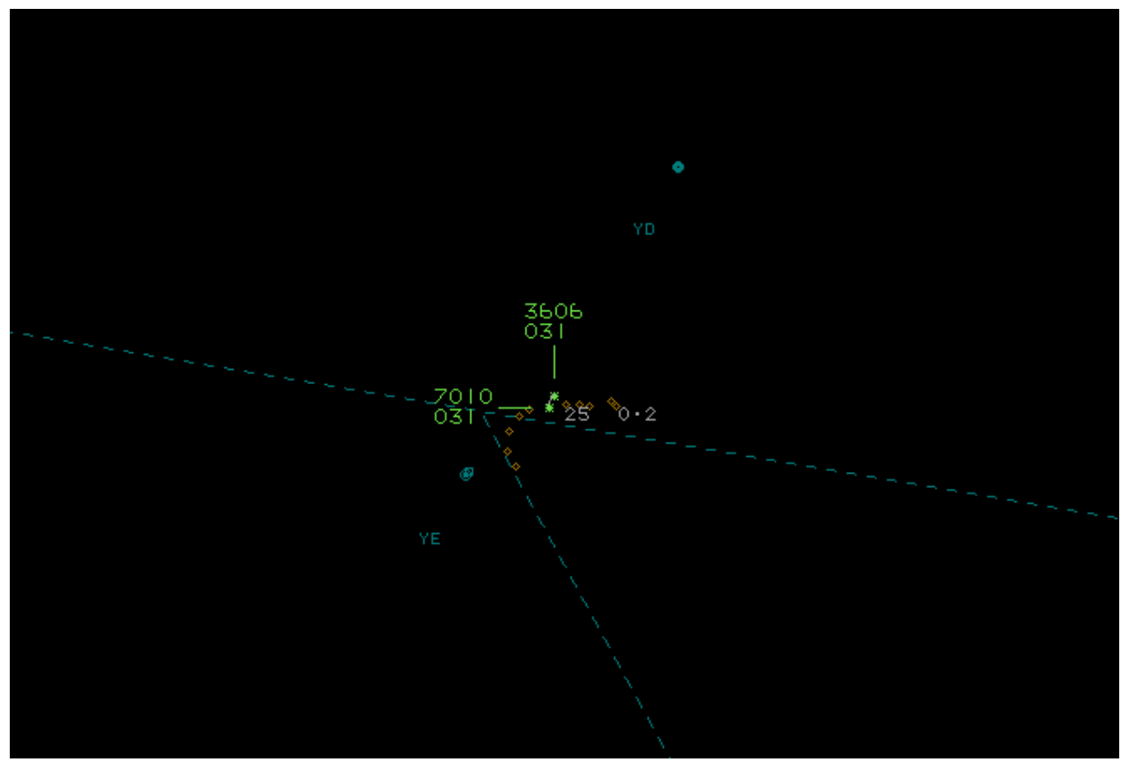
Figure 3 - CPA

The investigation into this incident noted that the order book available to the Cranwell Approach Controller did not reference the fact that PFLs could be conducted from above 2500ft and this was reinforced by the fact that High Key at Cranwell is 2500ft. It was subsequently identified that the aircrew manuals indicated that PFLs could be conducted from 3000ft. With this preconception it is unsurprising that the Cranwell Approach Controller was content that there would be sufficient separation between the aircraft but, having warned Waddington about the situation it would have been prudent to also have informed Barkston Tower.