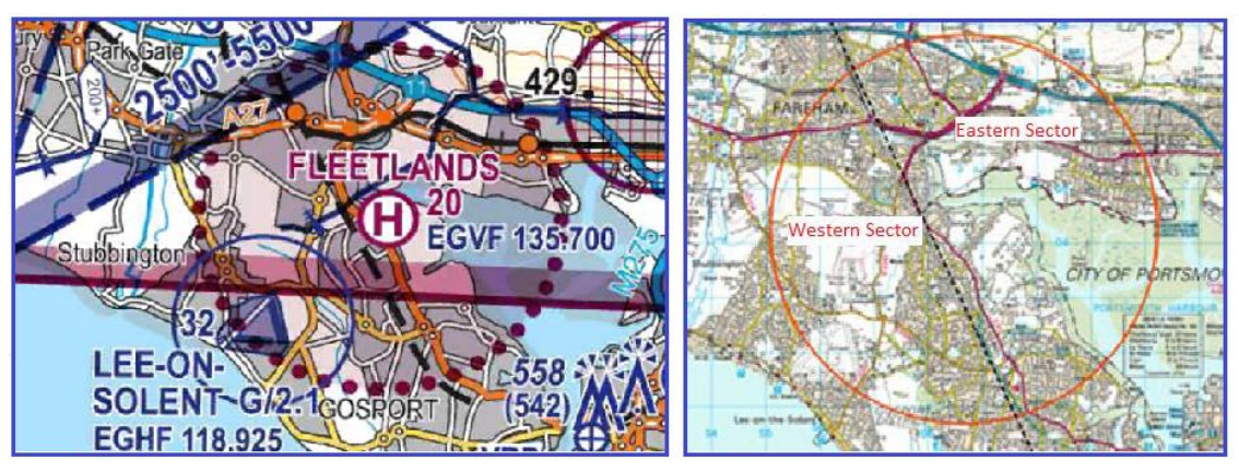
Figure 1:Topographical Chart 1:250,000 Figure 2: Chart extract from Lee on Solent visitors Guide

CAA ATSI had access to area radar recording. There is no facility to record RTF at Lee-on-Solent. CAA ATSI discussed the occurrence with the Air/Ground (A/G) operator.