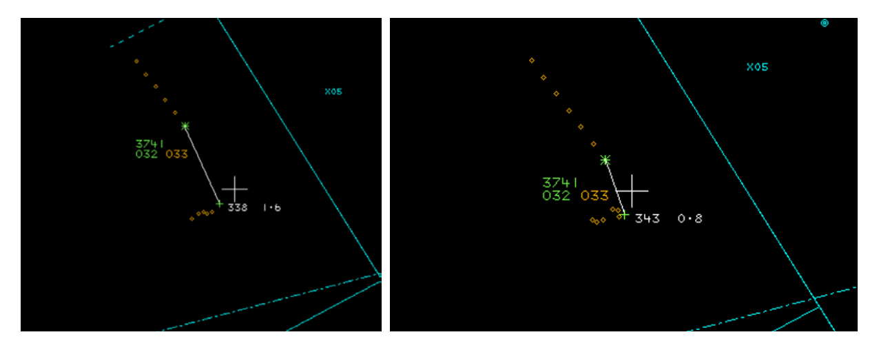
Figure 3: Geometry at 1021:13 (A400 squawking 3741; primary contact)

At 1021:13 (Figure 3), Traffic Information is passed for the fourth time 'previously called traffic now south half mile tracking east no height information'.